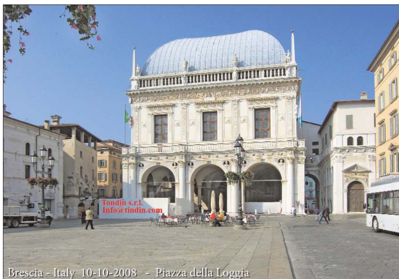
Brescia - Italy 10-10-2008 - Piazza della Loggia